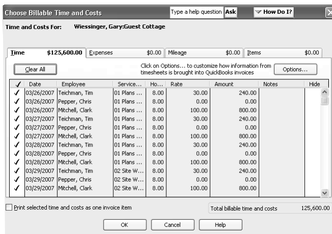
4: You can choose to add any tracked hours you've marked as billable directly to an invoice.

These are only a couple of examples. The Jobs, Time & Mileage section of the Reports menu includes several reports based on allocated jobs.