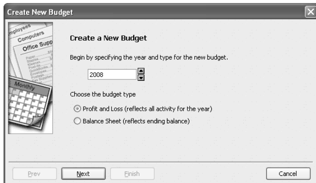
1: You can create a budget for any upcoming fiscal year.